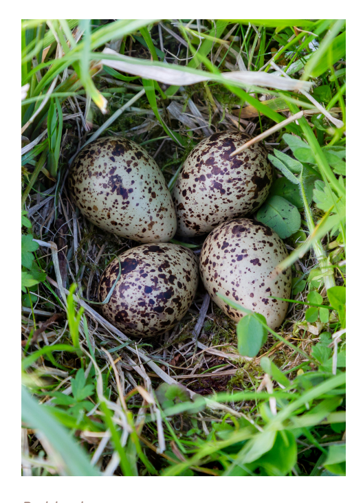
Redshank eggs