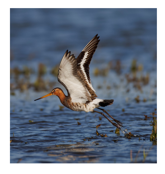
Black Tailed Godwit

The protection of meadow birds leads to a shift to results-based flexible farming schemes.